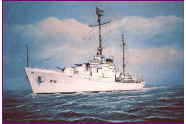
U.S.Coast Guard Cutter Spencer