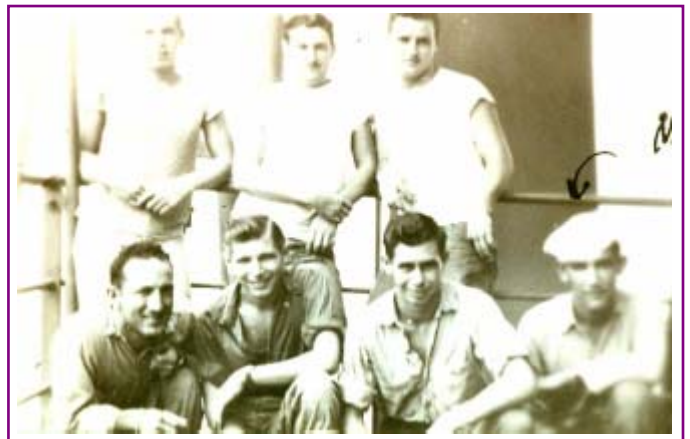
USS CELENO Radio Operations Crew "I am the guy with the Hat"

I graduated in 1943, and was off a few weeks past my 17th birthday to my first government job. This was inspecting radio frequency crystals for the U. S. Army Signal Corps Inspection Agency, at a factory in Attleboro, Massachusetts. There, later that summer, I was notified that I had been awarded the VWOA scholarship, and the Signal Corps released me in order to start RCA Institute. (I went to a VWOA award dinner in NYC, that is in your records.)