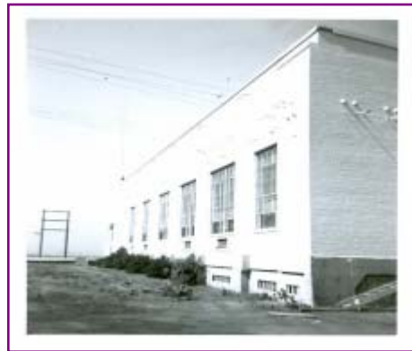
CAA Transmitter Station at Belmont, CA 1948

of the "extras" for the radiomen who stood watch. I also kept the radar and other gadgets working, as the only technician on the ship. One thing I did was help copy the news, sent in CW, and helped put out a ship's newspaper. (I later got both commercial FCC radio and radiotelegraph licenses, as well as the amateur license, now W7NSN.)