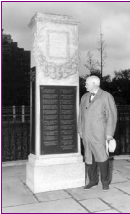
Former Honorary WVOA President and radio pioneer, Dr. Lee DeForest, SK at the Wireless Operators Monument