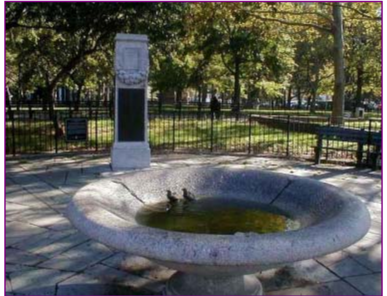
VWOA MEMORIAL MONUMENT AS PREVIOUSLY INSTALLED IN NYC BATTERY PARK